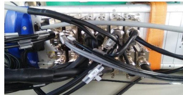
Instrumented measurement system

The following is a brief description of the measurement devices supplied by imc Italy, which have enabled CURTI to meet the above mentioned requirements.