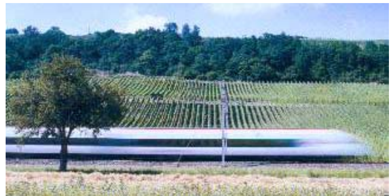
An ICE3 passing near the Rhein river during testing. 80