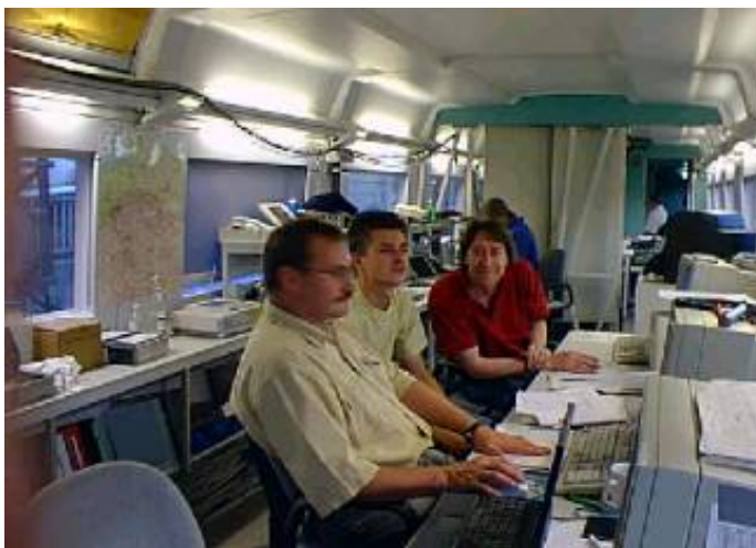
Inside the ICE Test & Measurement car.

As with any system with a large channel count, one of the most important requirements for the ICE testing crew is having an easy way to configure the over 500 channels of the multiple measure-